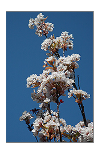
Amanogawa Flowering Cherry flowers