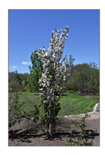
Amanogawa Flowering Cherry in bloom