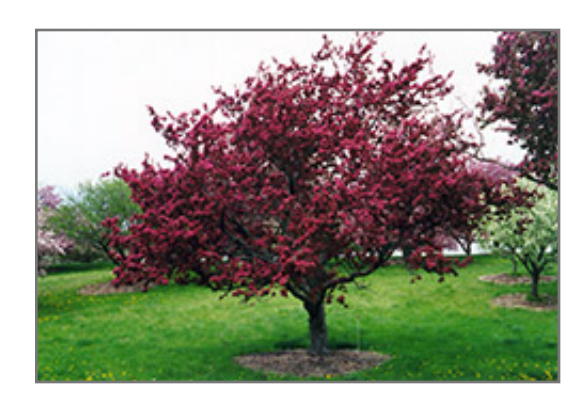
Profusion Flowering Crab in bloom

Profusion Flowering Crab is bathed in stunning clusters of fragrant cherry red flowers along the branches in mid spring, which emerge from distinctive dark red flower buds before the leaves. It has attractive coppery-bronze-tipped dark green foliage which emerges purple in spring. The pointy leaves are highly ornamental and turn yellow in fall. The fruits are showy ruby-red pomes carried in abundance from early to late fall.