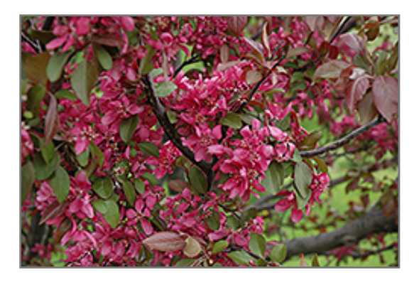
Profusion Flowering Crab flowers