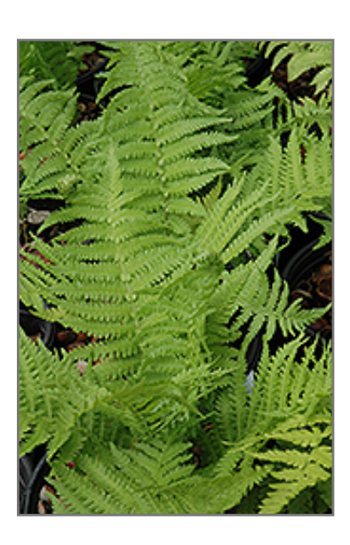
The King Ostrich Fern foliage