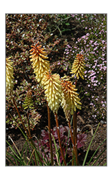
Torchlily flowers

Hummingbirds love the beautiful yellow and red colored bottlebrush type flowers; the blooms rise from grassy, evergreen foliage in midsummer to create an unusual yet brilliant border or container planting; makes a great cutflower