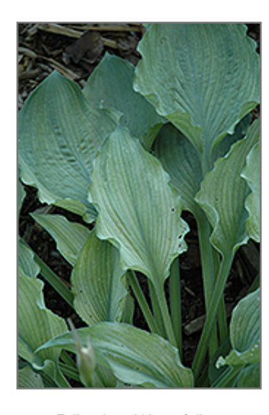
Fallen Angel Hosta foliage

This interesting hosta has leaves that emerge light green then turn blue-green and finally green in late summer; provides beautiful texture and contrast to other plants; cream spikes of flowers in mid-summer rise over this ever changing foliage