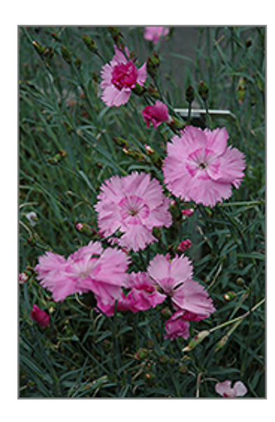
Pinks flowers

Deliciously clove-scented, frilly velvety rose, purple, white and red flowers; optimal site is full sun with ample moisture; seeds freely but divide for truest color