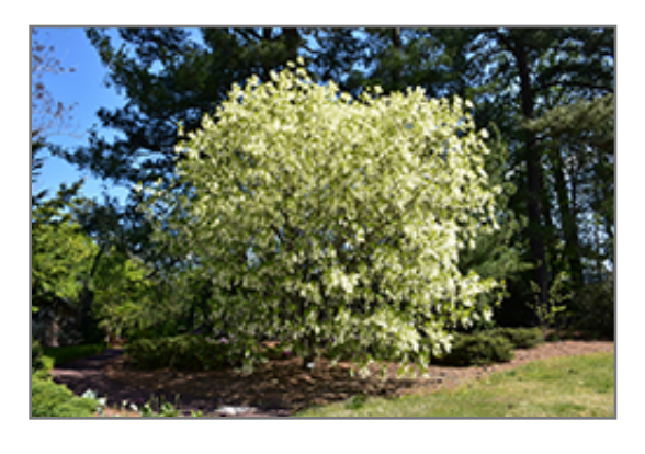
White Fringetree in bloom

White Fringetree is a multi-stemmed deciduous tree with a more or less rounded form. Its relatively coarse texture can be used to stand it apart from other landscape plants with finer foliage.