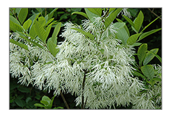
White Fringetree flowers

This is a relatively low maintenance tree, and should only be pruned after flowering to avoid removing any of the current season's flowers. It has no significant negative characteristics.