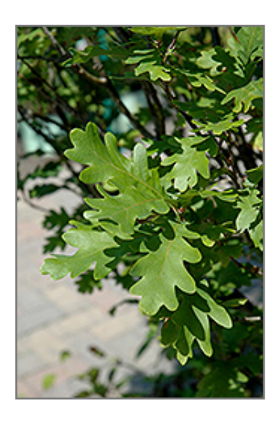
Crimson Spire Oak foliage

This tree should only be grown in full sunlight. It is very adaptable to both dry and moist locations, and should do just fine under average home landscape conditions. It is not particular as to soil type or pH. It is highly tolerant of urban pollution and will even thrive in inner city environments. This particular variety is an interspecific hybrid.