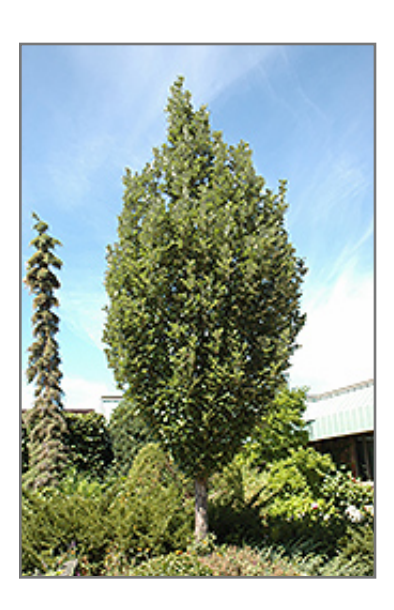
Crimson Spire Oak