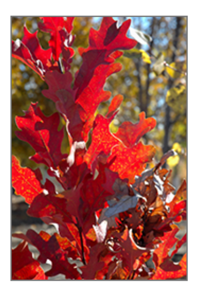
Crimson Spire Oak in fall