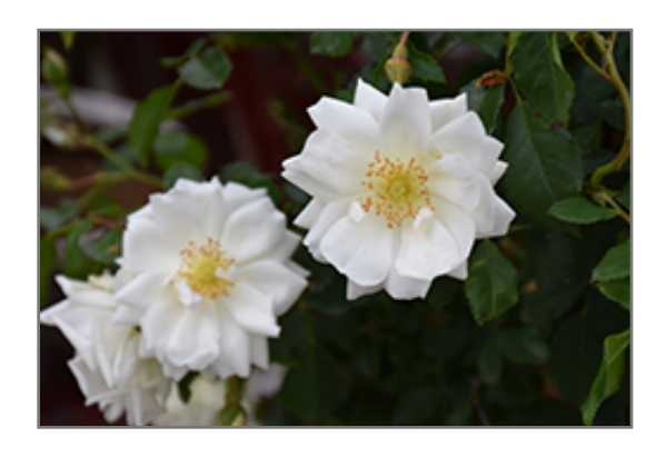
Flower Carpet White Rose flowers

Masses of white blossoms with yellow centers are presented on this true easy care groundcover rose; simple to grow and easy to maintain with no spraying; cut back to one third in late winter