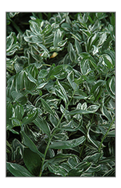
Variegated Solomon's Seal foliage

Attractive variegated leaves is what sets this variety apart; elegant nodding silky white blooms in late spring above mounded foliage is attractive all season long makes this a great choice for the shaded area