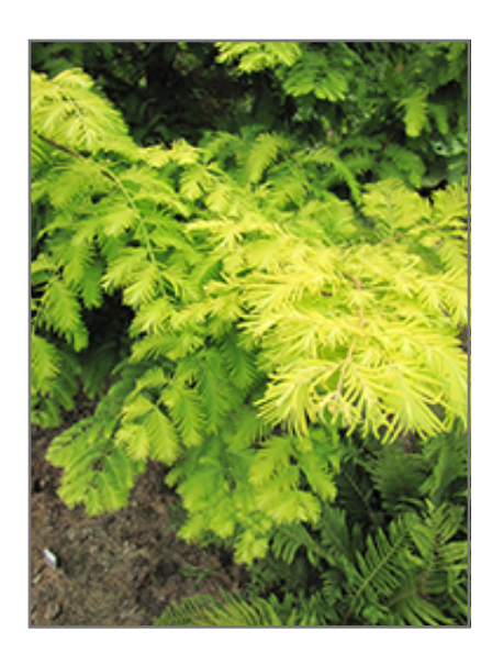
Gold Rush Dawn Redwood foliage