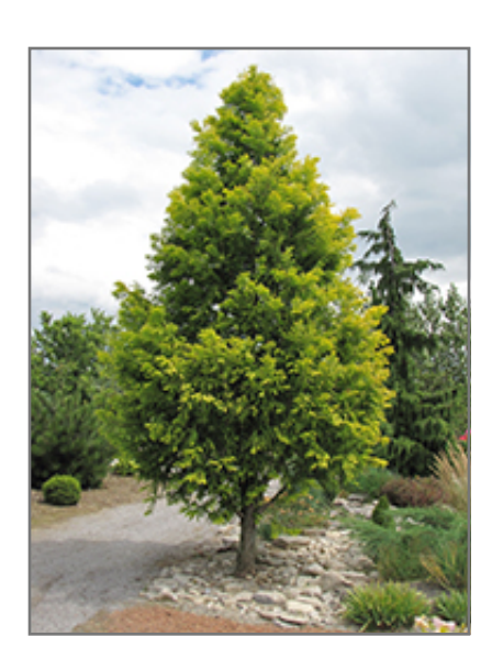
Gold Rush Dawn Redwood