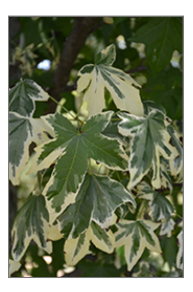
Silver King Sweet Gum foliage