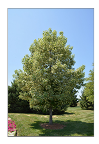
Silver King Sweet Gum