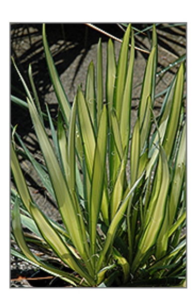
Garland Gold Adam's Needle foliage