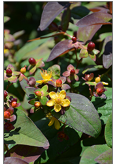
Albury Purple St. John's Wort flowers