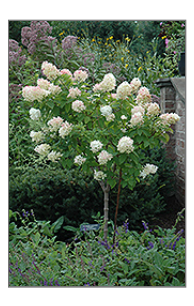
Limelight Hydrangea (tree form) in bloom

Limelight Hydrangea (tree form) features bold conical lime green flowers with white overtones at the ends of the branches from mid summer to late fall. The flowers are excellent for cutting. It has green deciduous foliage. The pointy leaves do not develop any appreciable fall colour.