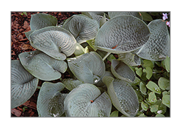
Abiqua Drinking Gourd Hosta foliage

Large leaved ornamental blue-green leaves are cupped, nearly round and have a dull glaucous bloom; provides beautiful texture and contrast to other plants; near-white spikes of flowers in mid-summer