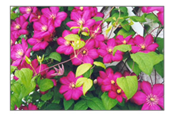
Ville de Lyon Clematis flowers

This is a relatively low maintenance woody vine. It is a Type 3 clematis; each spring it should be pruned back to within a few inches of the ground, as it flowers on new wood of the season. It is a good choice for attracting hummingbirds to your yard. It has no significant negative characteristics.