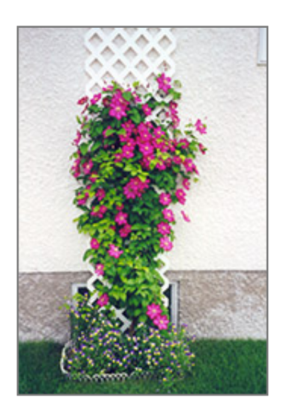
Ville de Lyon Clematis in bloom

Ville de Lyon Clematis is recommended for the following landscape applications;