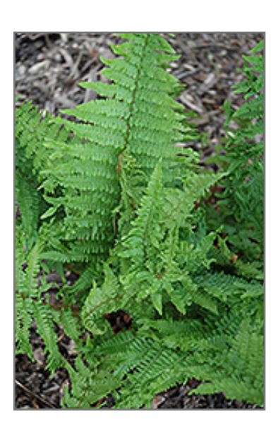
Rumplestiltskin Buckler Fern foliage

Rumplestiltskin Buckler Fern is primarily valued in the landscape or garden for its cascading habit of growth. Its tiny crinkled ferny compound leaves remain green in colour throughout the year.