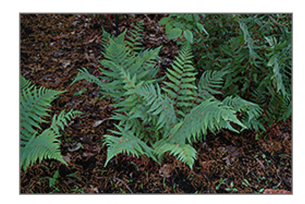
Dixie Wood Fern