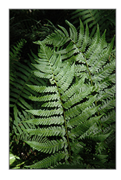
Dixie Wood Fern foliage