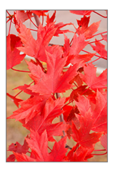
Scarlet Sentinel Maple in fall