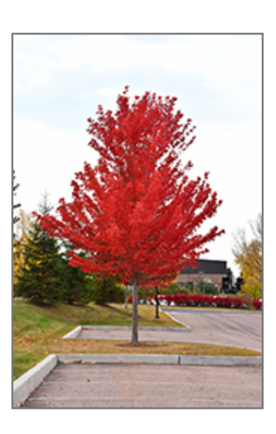
Scarlet Sentinel Maple in fall