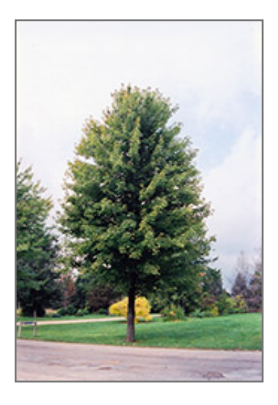
Scarlet Sentinel Maple

This tree should only be grown in full sunlight. It is quite adaptable, prefering to grow in average to wet conditions, and will even tolerate some standing water. It is not particular as to soil type or pH. It is highly tolerant of urban pollution and will even thrive in inner city environments. This particular variety is an interspecific hybrid.