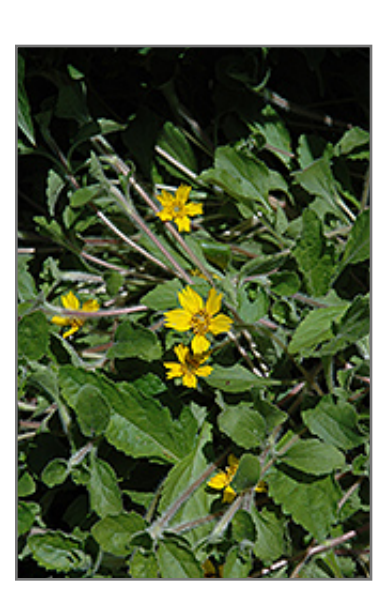
Eco Lacquered Spider Goldenstar flowers

This perennial groundcover will spread by stolons and can reach many feet in a few years; foliage is a mix of chartreuse and green and is very glossy, cheery yellow buttercups cover the plant in spring; a vigorous groundcover