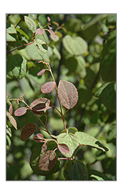
Strawberry Katsura Tree foliage

Strawberry Katsura Tree is primarily valued in the landscape for its distinctively pyramidal habit of growth. It has rich green deciduous foliage. The heart-shaped leaves turn an outstanding rose in the fall. The shaggy brown bark adds an interesting dimension to the landscape.