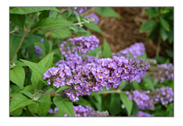
Lo & Behold Blue Chip Butterfly Bush flowers

Lo & Behold Blue Chip Butterfly Bush features showy panicles of fragrant purple flowers at the ends of the branches from mid summer to mid fall. The flowers are excellent for cutting. It has grayish green deciduous foliage. The fuzzy narrow leaves do not develop any appreciable fall colour.