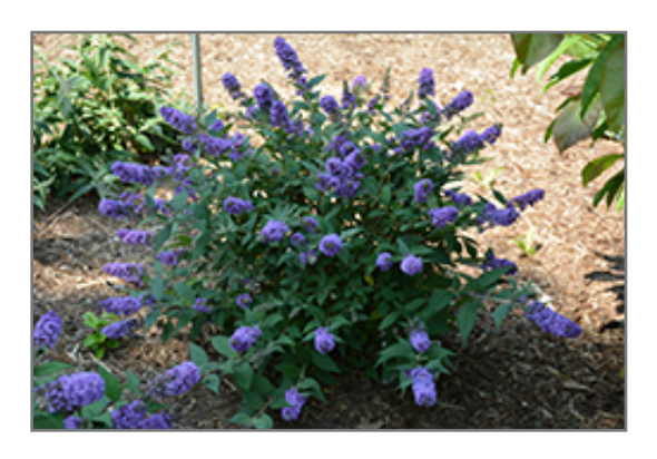
Lo & Behold Blue Chip Butterfly Bush in bloom