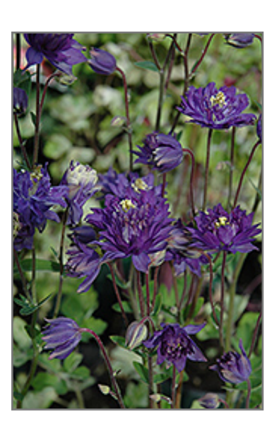
Clementine Blue Columbine flowers

Clementine Blue Columbine is smothered in stunning nodding blue bell-shaped flowers at the ends of the stems from late spring to early summer. The flowers are excellent for cutting. Its lobed compound leaves remain bluish-green in colour throughout the season.