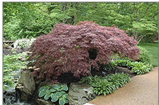
Red Select Japanese Maple Photo courtesy of NetPS Plant Finder