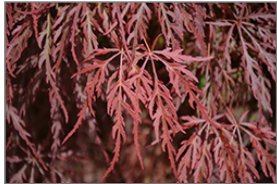
Red Select Japanese Maple foliage

Red Select Japanese Maple is recommended for the following landscape applications;