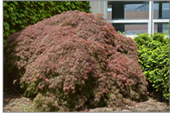
Red Select Japanese Maple

This tree does best in full sun to partial shade. You may want to keep it away from hot, dry locations that receive direct afternoon sun or which get reflected sunlight, such as against the south side of a white wall. It prefers to grow in average to moist conditions, and shouldn't be allowed to dry out. It is not particular as to soil pH, but grows best in rich soils. It is somewhat tolerant of urban pollution, and will benefit from being planted in a relatively sheltered location. Consider applying a thick mulch around the root zone in winter to protect it in exposed locations or colder microclimates. This is a selected variety of a species not originally from North America.