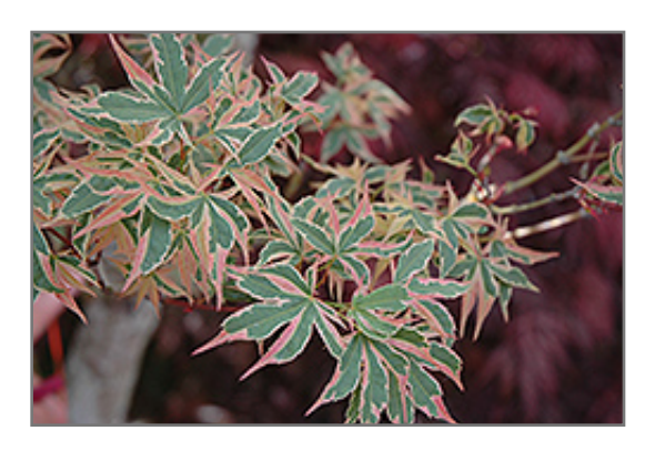
Beni Schichihenge Japanese Maple foliage

This beautiful small accent tree features dazzling summer foliage of blue-green with cream and rose variegation and orange undertones for an explosion of color, also great fall color; Japanese maples are the most coveted of all small landscape trees