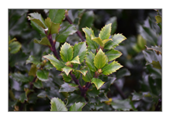
Berri-Magic Royalty Combination Meserve Holly foliage

Berri-Magic Royalty Combination is Blue Prince and Blue Princess planted together in one container, producing loads of berries without needing a separate pollinator; rich deep blue-green evergreen foliage creates an excellent hedge or screen