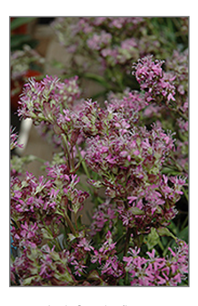
Arctic Campion flowers

Native to the Arctic regions of North America and Europe, this small grassy-like tufted-mound perennial produces sweet little ball-like clusters of rosy-pink blooms; the miniature form makes this plant a spectacular addition for any rock or scree garden