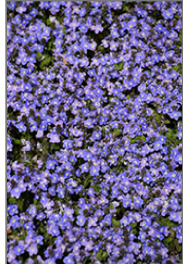
Crystal River Speedwell flowers