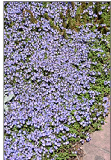
Crystal River Speedwell in bloom