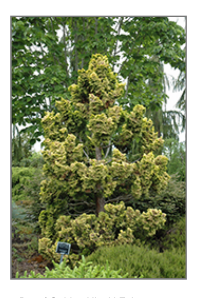
Dwarf Golden Hinoki Falsecypress

This is a relatively low maintenance shrub, and should not require much pruning, except when necessary, such as to remove dieback. It has no significant negative characteristics.