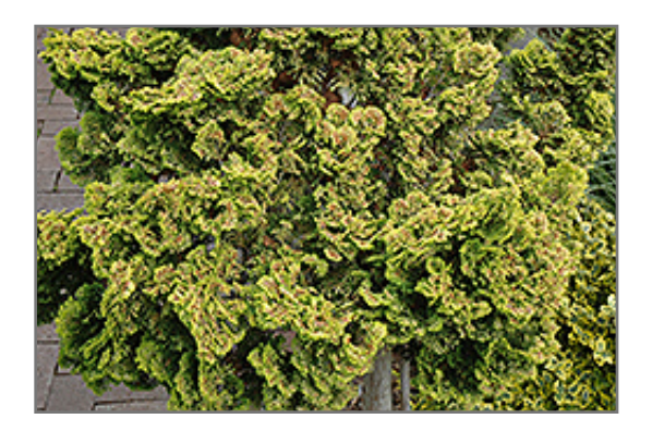
Dwarf Golden Hinoki Falsecypress foliage

Dwarf Golden Hinoki Falsecypress is recommended for the following landscape applications;