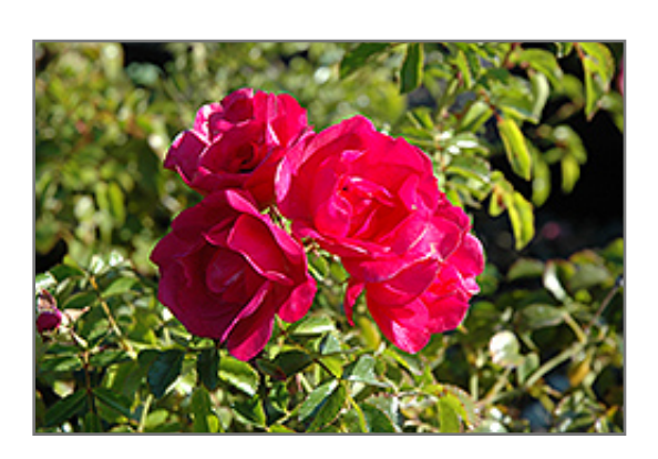
Flower Carpet Pink Rose flowers

Produces masses of lovely pink blooms continuously all season, whether planted single or massed this rose will be noticed; very low maintenance and disease resistant, makes a perfect flowering ground cover, great in a planter