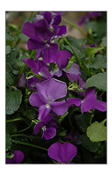
Purple Showers Pansy flowers

A beautiful clump forming violet with large slightly fragrant purple flowers that creates a dramatic color display in the garden, the flowers are long stemmed and perfect for cutting and displaying; biennial in mild winters