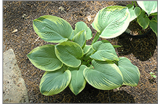
Robert Frost Hosta