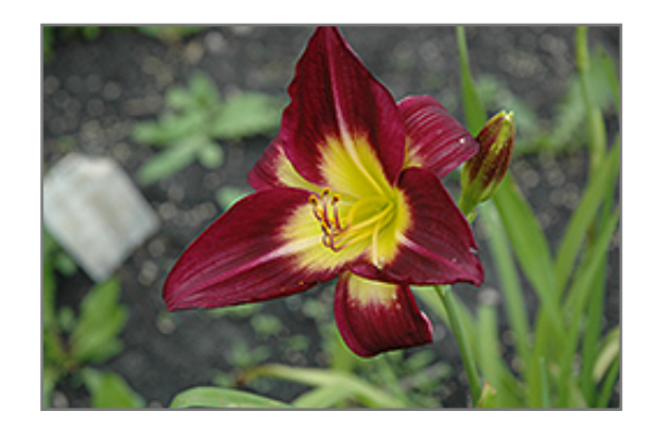
Night Beacon Daylily flowers