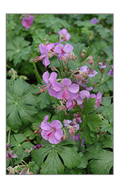
Cambridge Cranesbill flowers

This compact plant is covered with saucer-shaped flowers in shades of lilac, plum and purple, very attractive; deadhead spent flowers for reblooming; occasionally has good fall color