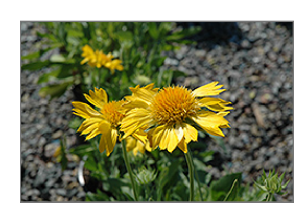
The Sun Blanket Flower flowers