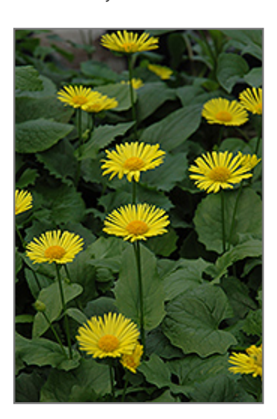
Leonardo Compact Leopard's Bane flowers