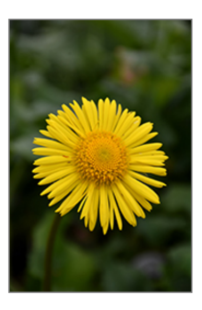
Leonardo Compact Leopard's Bane flowers