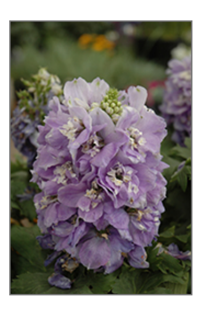
Aurora Lavender Larkspur flowers

Magnificent display of compact lavender flowers on towering spikes; good vertical form, dense flower spikes, strong stems; excellent uniformity