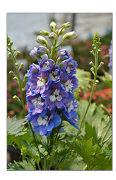
Aurora Blue Larkspur flowers

Magnificent display of compact flowers on towering spikes; irridescent mid-blue flowers glow with a violet sheen and bright white centers; good vertical form, dense flower spikes, strong stems; excellent uniformity