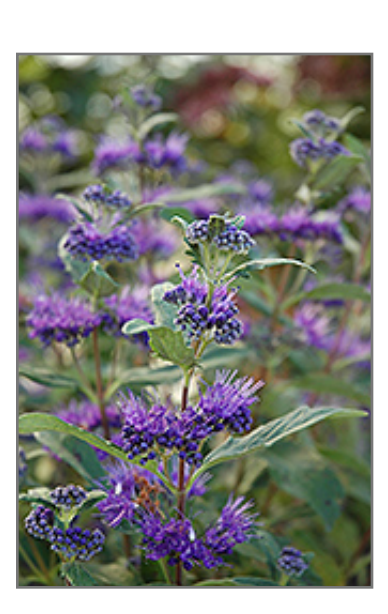
Dark Knight Caryopteris flowers

Dark Knight Caryopteris features dainty cymes of royal blue flowers along the branches from late summer to early fall. The flowers are excellent for cutting. It has grayish green foliage with silver undersides. The fuzzy oval leaves do not develop any appreciable fall colour.