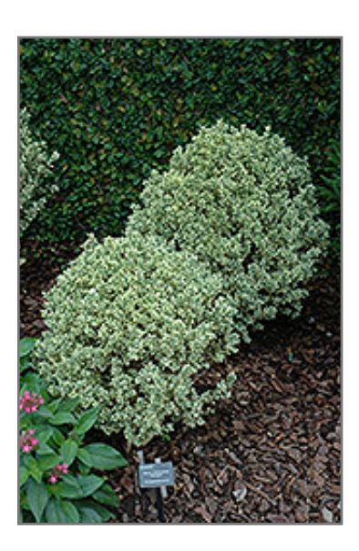
Variegated Boxwood