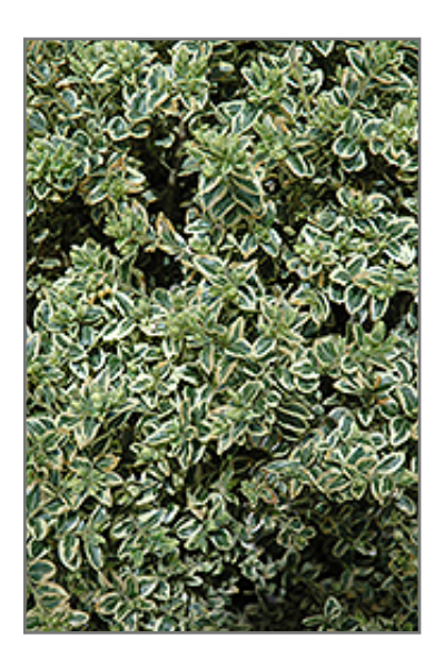
Variegated Boxwood foliage