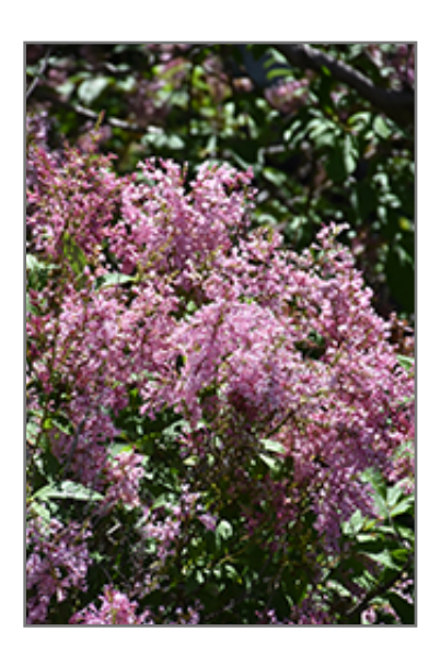
Josee Lilac flowers

Josee Lilac is covered in stunning panicles of fragrant lavender flowers at the ends of the branches in late spring, which emerge from distinctive pink flower buds. The flowers are excellent for cutting. It has dark green deciduous foliage. The small pointy leaves do not develop any appreciable fall colour.