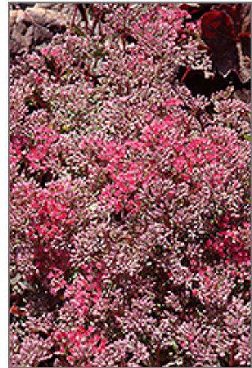
Rosy Glow Stonecrop flowers

Rosy Glow Stonecrop is recommended for the following landscape applications;