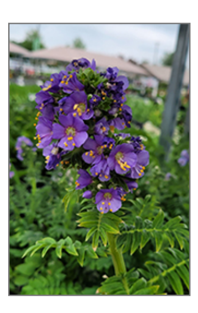
Heavenly Habit Jacob's Ladder flowers

Heavenly Habit Jacob's Ladder has masses of beautiful spikes of lightly-scented lilac purple star-shaped flowers with white eyes and yellow anthers rising above the foliage from mid spring to mid summer, which are most effective when planted in groupings. The flowers are excellent for cutting. Its ferny pinnately compound leaves remain dark green in colour throughout the season.