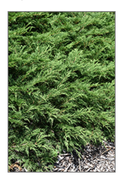
Northern Pride Russian Cypress

Northern Pride Russian Cypress is recommended for the following landscape applications;