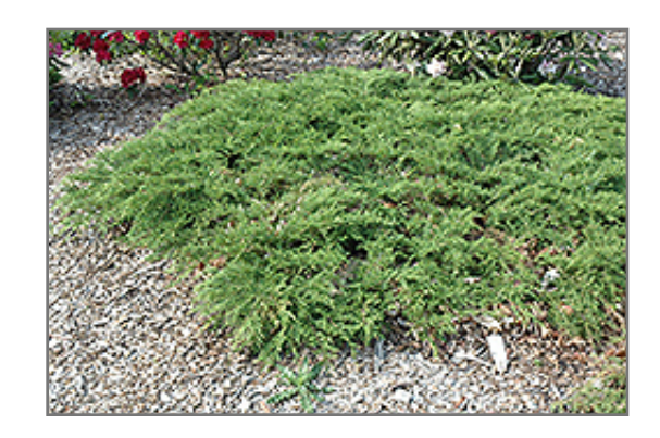
Northern Pride Russian Cypress

This is a relatively low maintenance shrub, and is best pruned in late winter once the threat of extreme cold has passed. It has no significant negative characteristics.