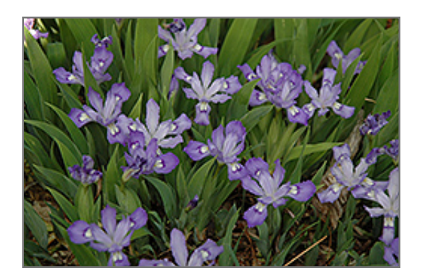
Dwarf Crested Iris flowers