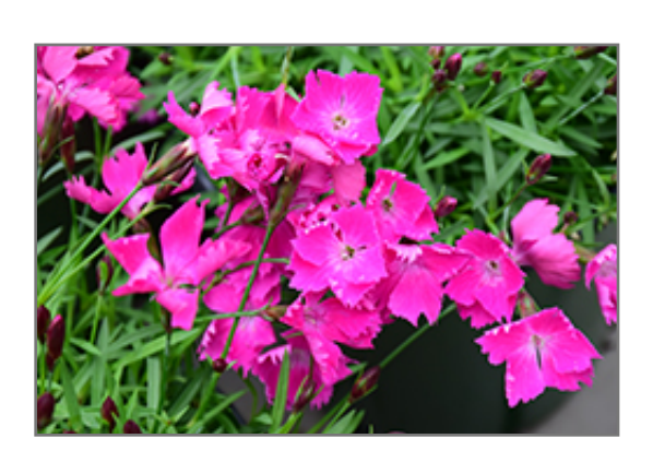
Beauties Kahori Pinks flowers

Lovely flowers that are deep pink with white eyes, covering mounds of fine foliage; great for flower arrangements; reblooms; pair up with summer blooming perennials and annuals to time a continued flower display