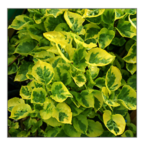
Miranda Hydrangea foliage

A truly delightful and reliable garden shrub which features the dantiest lacecap flowers consisting of an outer ring of sterile florets surrounding a dome of either soft pink or very light blue, depending on soil pH, petals often have subtle streaking