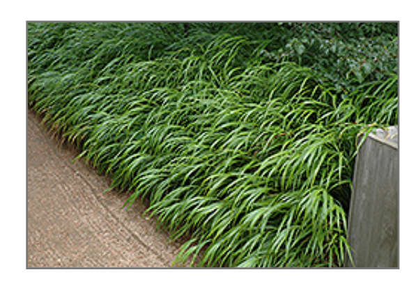
Japanese Woodland Grass

A moisture and shade loving ornamental grass that produces handsome mounds of arching slender leaves in green, golds or variegated patterns; easy to grow and low maintenance, perfect for borders, beds, containers or used as groundcover