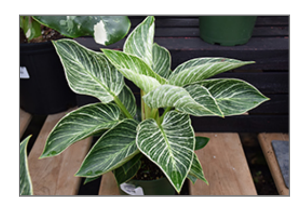
Prismacolor Birkin Philodendron in full

This is a dense herbaceous evergreen houseplant with an upright spreading habit of growth. This plant should not require much pruning, except when necessary to keep it looking its best.