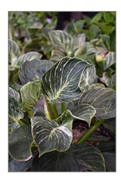
Prismacolor Birkin Philodendron foliage